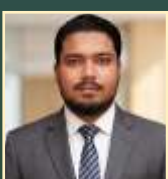
Abhijeet Mishra Consultant-Ministry of Labour and Employment, Govt of India